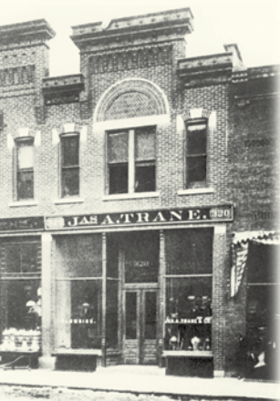
Trane Storefront La Crosse, Wisconsin 1891

Trane has a tradition of quality lasting more than a century.