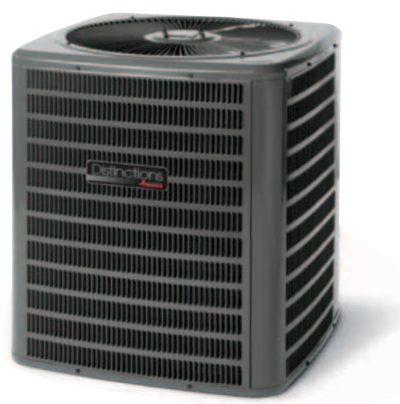
© 2012 Goodman Company, L.P. Amana is a registered trademark of Maytag Corporation or its related companies and is used under license to Goodman Company, L.P., Houston, TX. All rights reserved.