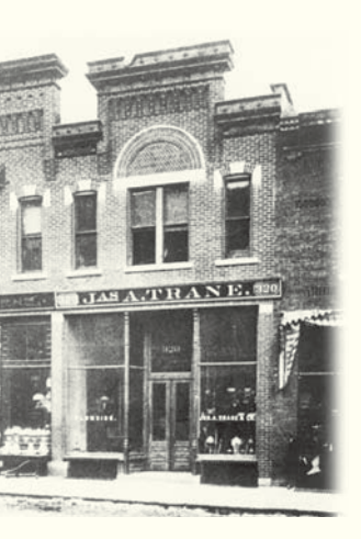
Trane Storefront La Crosse, Wisconsin 1891