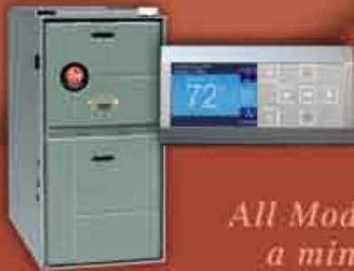
Model RGFG Upflow Model

All Models have a minimum 95% AFUE rating