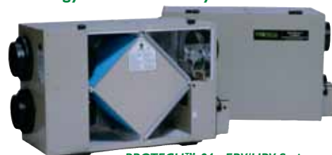
PROTECH™ 84 - ERV/HRV Series

Rheem Replacement Parts Division carries a full line of PROTECH™ Energy & Heat Recovery Ventilators