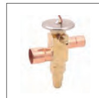
Thermal Expansion Valve

Thermostatic Expansion Valve (TXV) on each refrigerant circuit helps provide optimum performance across the entire unit operating range.